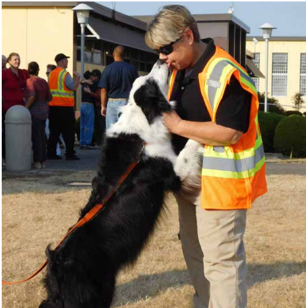
Above: Willamette Humane Society staff, volunteers, and adoptable dogs visited OSCI for the annual "Dog Days of Summer" event on August 29, 2016.