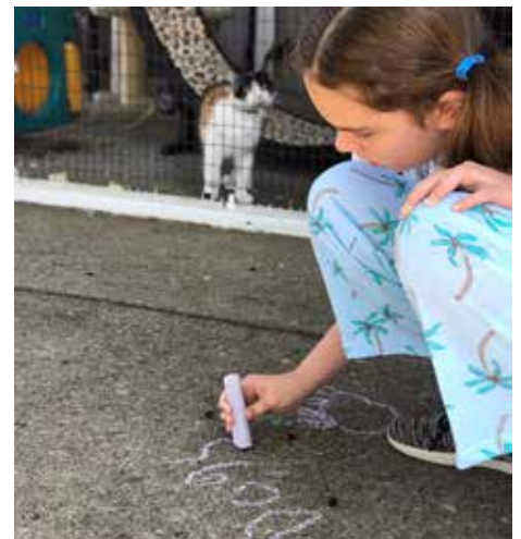
Above: Camp Paw Paw campers enjoy time during Willamette Humane Society's annual summer camps.

concluded with a pajama day and animal-themed movie and snacks. Interested in learning more about Willamette Humane Society's youth programs and student programs? Visit us at whs4pets.org or email us at education@whs4pets.org .